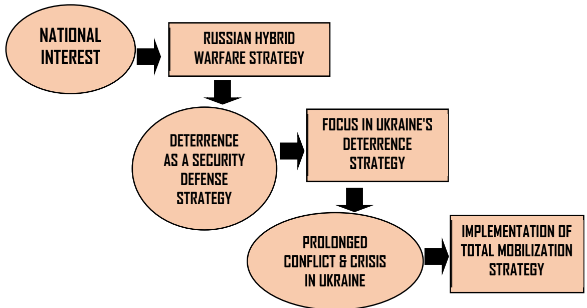
Figure 2.2 Frame of Mind

is Ukraine's implementation of a total mobilization strategy. All these elements are interrelated and form a coherent theoretical framework.