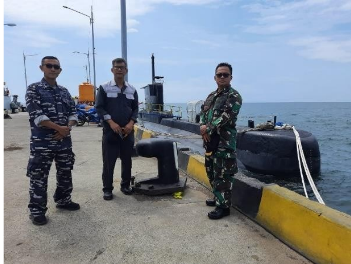
Foto peneliti saat melakukan penelitian di Kapal selam Cakra 401