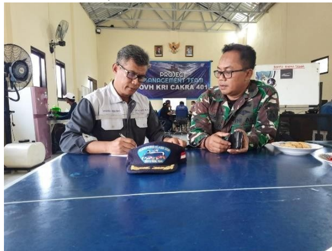
Foto salah satu responden yang sedang mengisi kuesioner penelitian