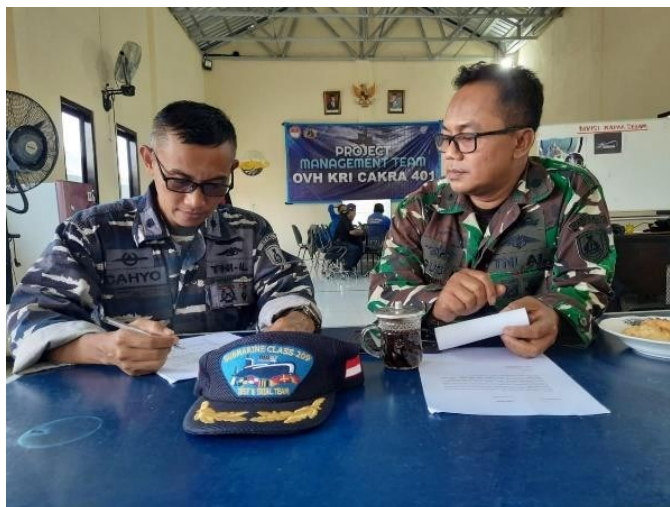
Foto salah satu responden yang sedang mengisi kuesioner penelitian