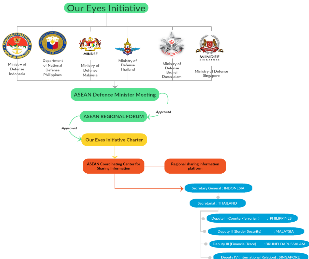
Fig. 1 Optimization Our Eyes Initiative by making it as a Regional Cooperation

Other regional countries like Vietnam, Myanmar, Cambodia and Laos would be welcome to join as a member of OEI; however, they will be the subject of Our Eyes Initiative Charter . These nations must ensure they fully observe the guidelines established under the agreement and openly provide information about all aspects of terrorism threats in the interests of this regional cooperation.